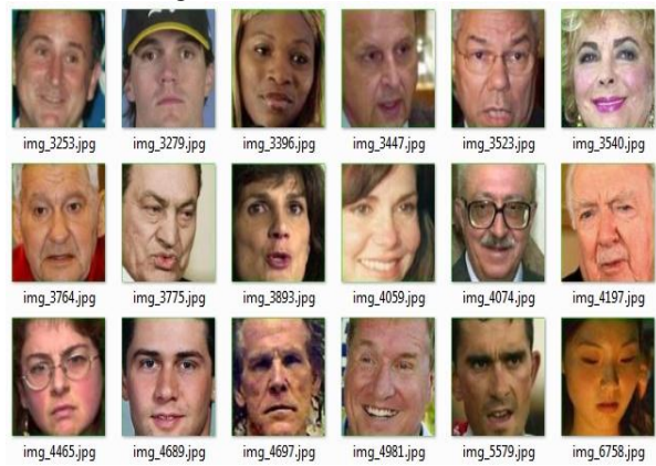
Fig 3:- Trained dataset

Using this algorithm, dataset is normalized which is called trained dataset so that input image is feasibly compared with dataset images[8].